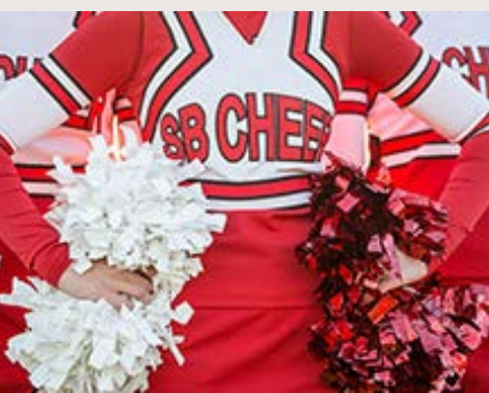
Cheerleading has evolved from the days of sideline jumping and pom-pom waving.