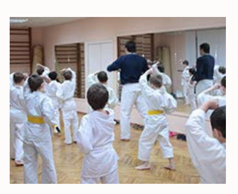
From the four main styles of Karate to the varieties of Kung Fu, Judo, Jujitsu and a host of others.