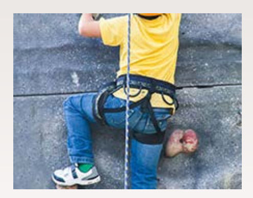
Being sure-footed, focused and decisive are key characteristics in successful wall climbing.