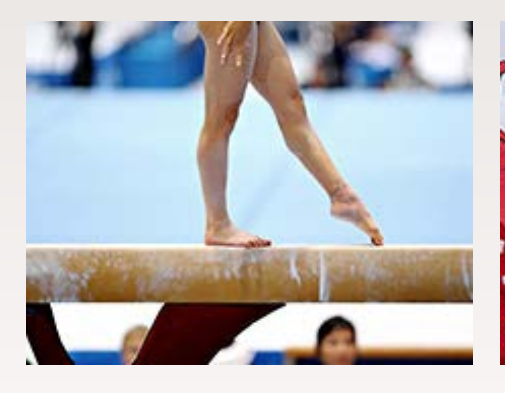
We enjoy the precision, balance, control and strength exhibited throughout a gymnastics routine.